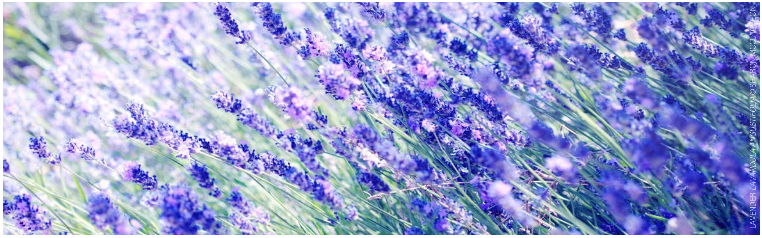
LAVENDER LAVANDULA ANGUSTIFOLIA